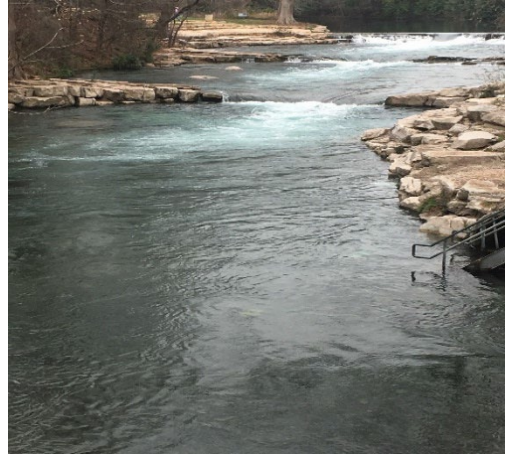
San Marcos River near the office

We have made changes to our Board and would like to welcome all members into the DRC!